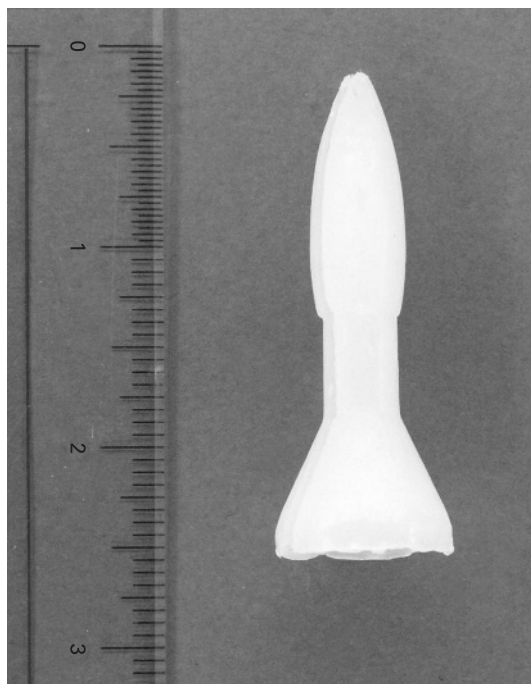
Figure 1 "Rectal Rocket" suppository.

research protocol within the past year or having a current male partner also enrolled in the study.